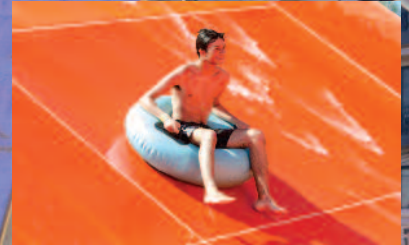
Easy Junior School student.