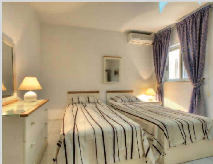
Easy School shared self-catering apartments.