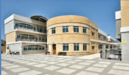
Easy Junior School.