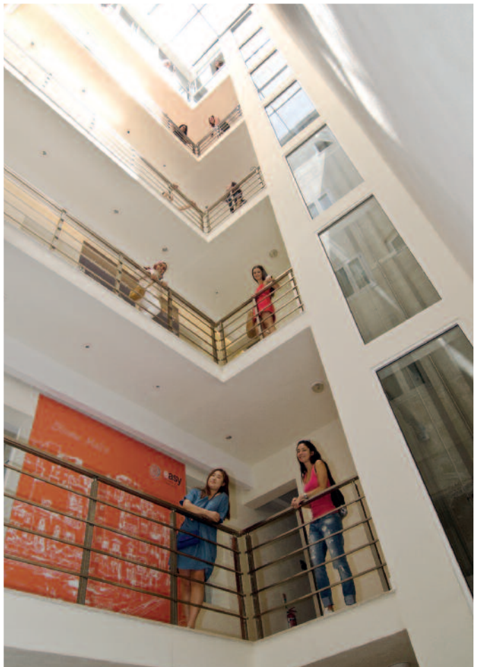
Photos of the new premises of Easy School of Languages.