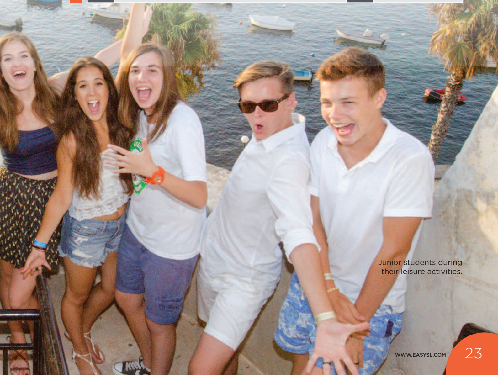
Junior students during their leisure activities.